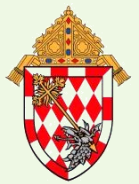
Archdiocese of Toronto