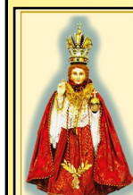
Pre-Authorized Giving Plan

Parishioners who would like to start using PAG or Credit Card donating methods can register using the forms found at the entrance of the church or by visiting the parish office.